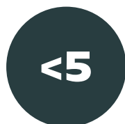
Minutes required for incident resolution

Case Study: The UK-based National Air Traffic Services (NATS) provides mission-critical and life-impacting air traffic control services. Before ServiceNow, NATS had over 170 different tools and screens for managing their ultra-critical IT infrastructure. Service availability and compliance were challenges in its environment. With ServiceNow and AIOps, NATS achieved impressive results to insure resilient services.