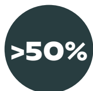
Faster engineer validation process