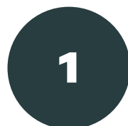
Unified service view enables faster incident resolution